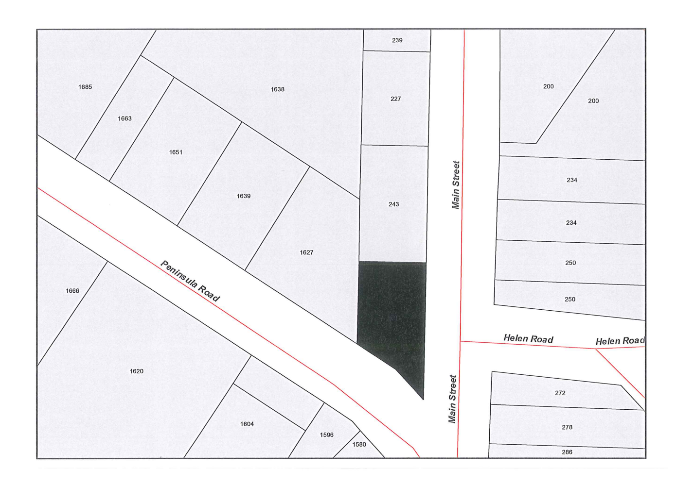
SCHEDULE 'A" Bylaw 1156